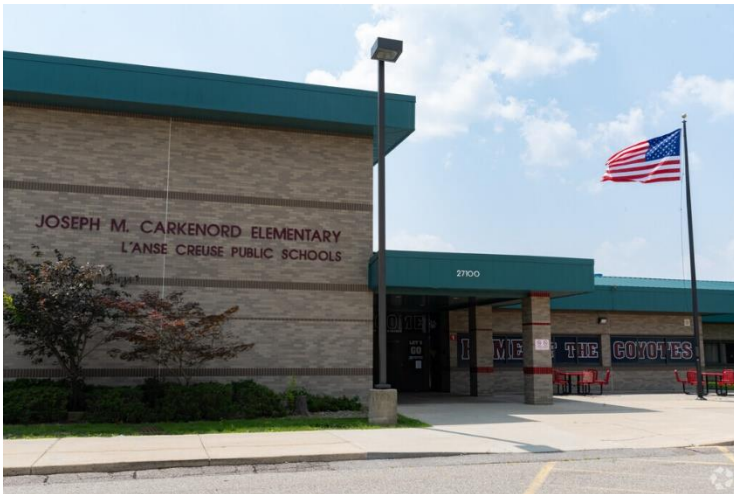
Carkenord Elementary School