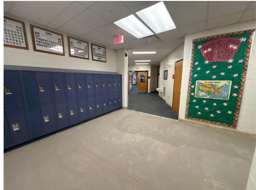
Lobbestael Gym Wing Corridor Floor Demo