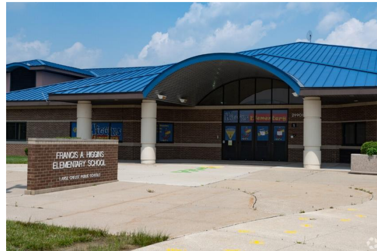
Higgins Elementary School