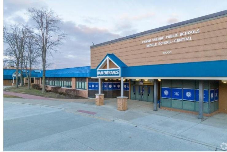
Middle School Central