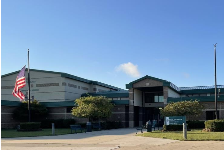
Middle School East