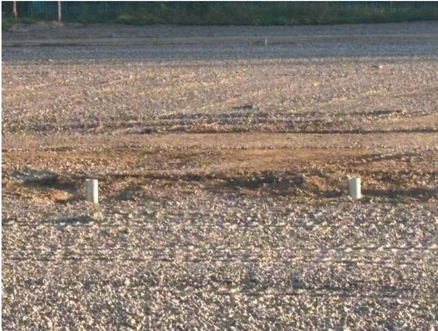
Tennis court net post foundations