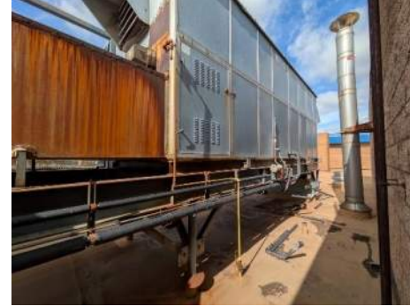
L'Anse Creuse High School