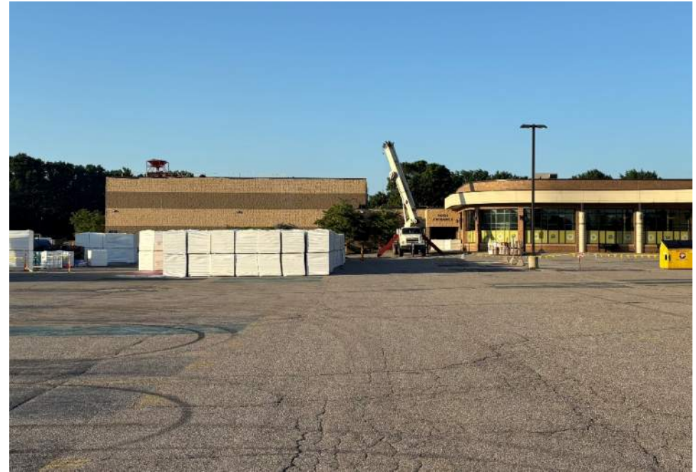
Pool Roof Completed