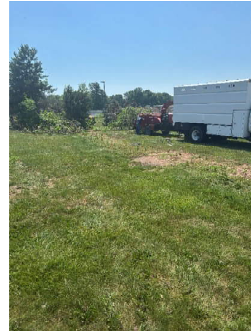
LCHS Tree Removal