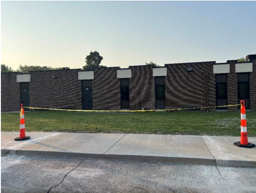
MSN Select Sidewalk Replacement