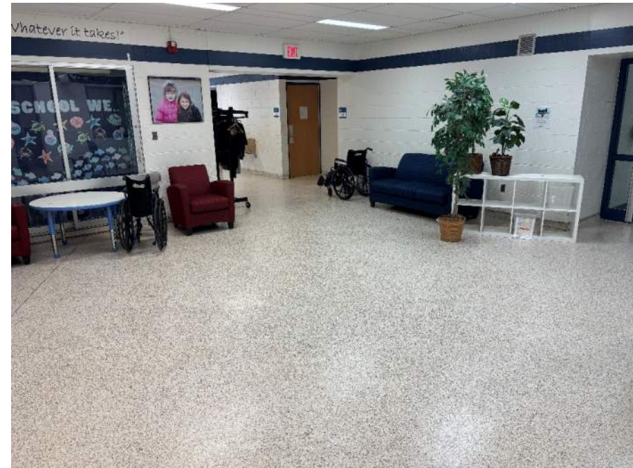
Yacks Lobby Terrazzo Floor