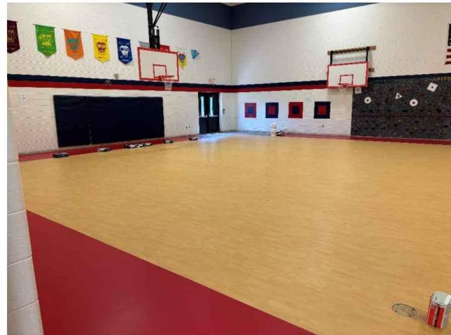
Lobbestael Gym Flooring prior to game lines