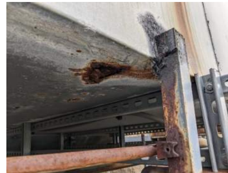
L'Anse Creuse North