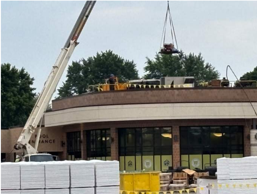
Roofing Kitchen, Cafeteria, and Commons