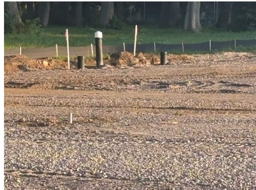
Tennis Court Storm Water Drainage Complete